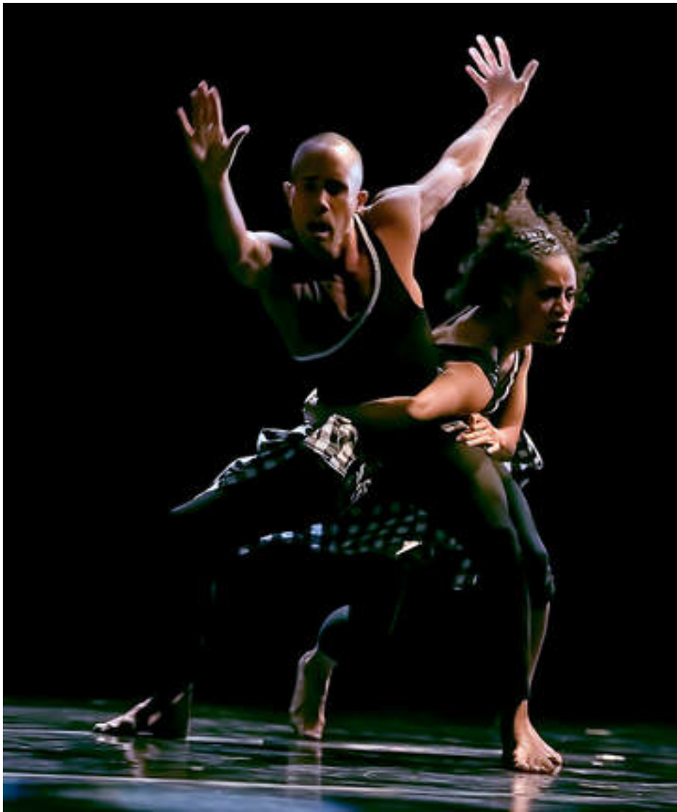
Dallas Black Dance Theatre